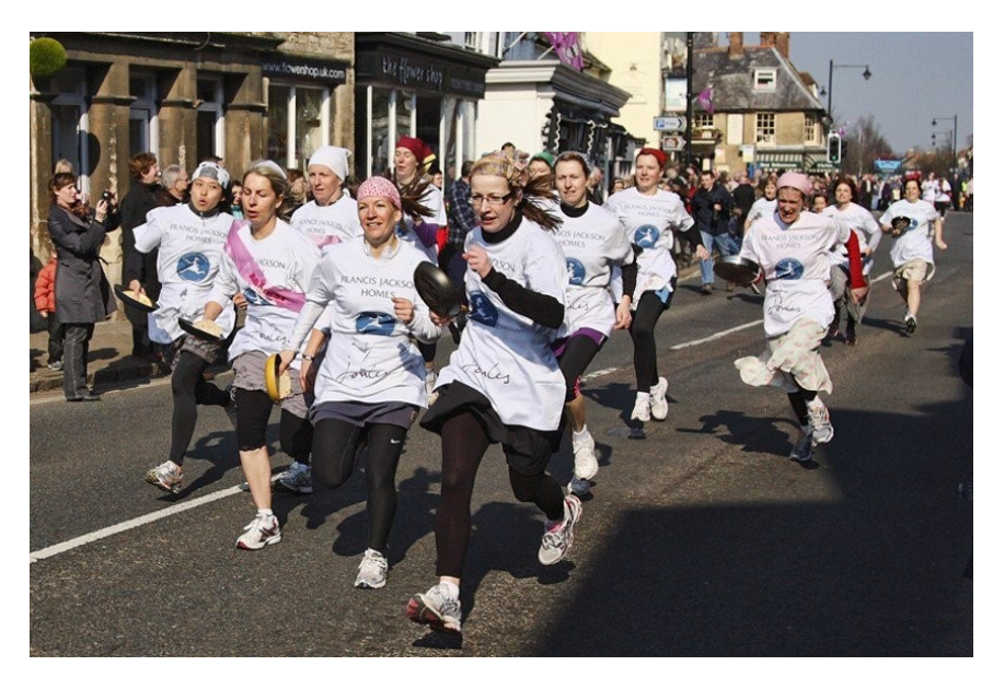
Kansas Pancake Race