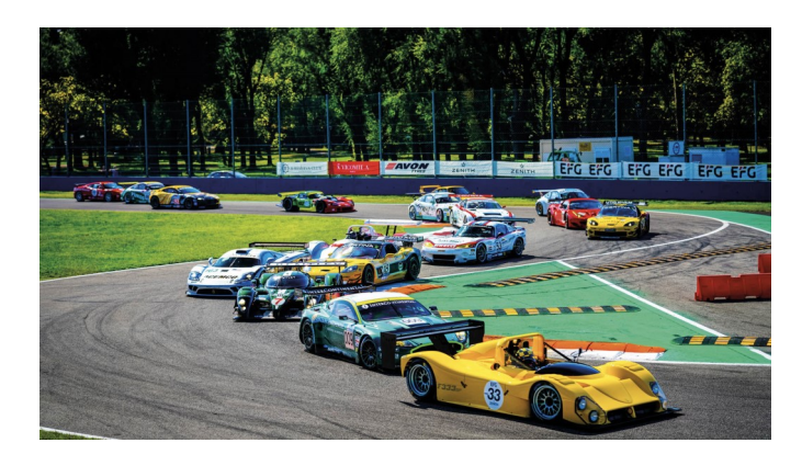
Auto racing, Monza

Indianapolis twinned with Monza, Italy because they both have a strong association with Auto racing . Sometimes business relationships are a factor, as with the twinning of Portland, Oregon with Bologna, Italy due to their shared Biotechnology industries and "shared attitude towards food!" Rochester, Minnesota and Knebworth, England partnered since both are centers of Medical research .