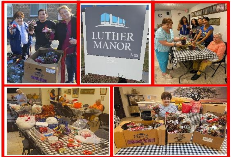
Tuesday Group Working on Christmas Pinecone for Donation to Luther Manor on 12/12/25